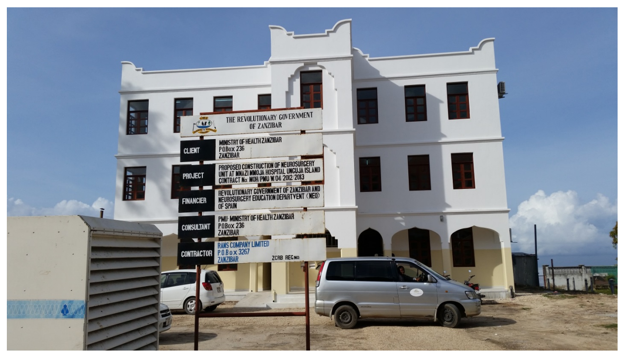
The NED institute, Mnazi Mmoja Hospital, Zanzibar, Tanzania, November, 2014.